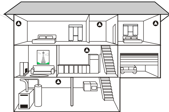
Figure 2: Recommended CO detector locations